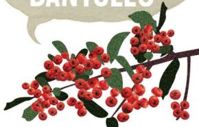
fig. 5 Firethorn ( Pyracantha sp. ) from south east of Europe and China