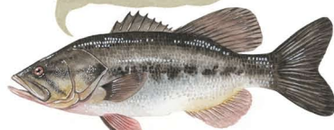
fig. 2 Largemouth bass ( Micropterus salmoides ) from North America