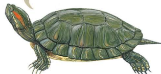
fig. 4 Red-eared slider ( Trachemys scripta ) from southern North America