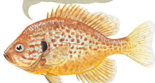
fig. 3 Pumpkinseed ( Lepomis gibbosus ) from North America