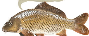
fig. 1 Common carp ( Cyprinus carpio ) from Eurasia