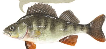
fig. 6 Perch ( Perca fluviatilis ) from Central Europe and Asia